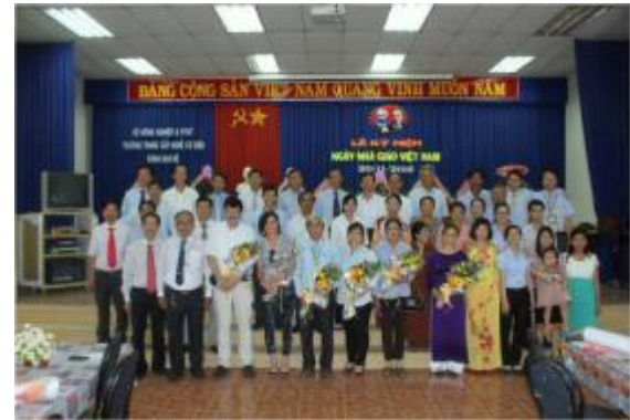
Figure 7. final ceremony in the school grounds of school of Agraministeriums in Vietnam near Saigon.

54 trainees were trained in Vietnam to the system WIAP