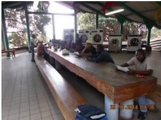
Figure 1: People / skilled workers in training at WIAP adults primarily training 4 maintenance people and 35 Berufssleute / machinists and 8 CNC skilled workers were eye forms in Angola after the system WIAP