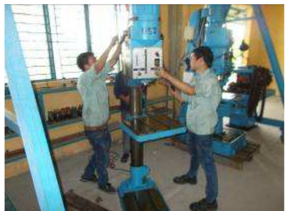
P34: Also all drills were removed from the wooden pallets, since we have found a lot of bugs in the wooden pallets.