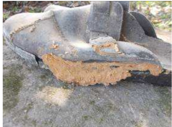
P38: Thousands vermin were there in the shoes, we have thrown away everything. Also, all wooden boxes removed.