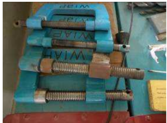
P10: These clamps we wanted in the mail send to Switzerland. But the state is not at all nice. If so having arrived in Switzerland that would be one of the greatest disgraces for our school system.