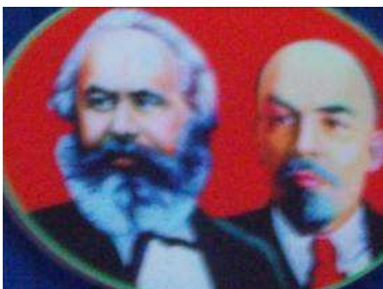
P54: Rear other wall nor the picture of Karl Marx and Lenin. The people, that played a very important role in communism.