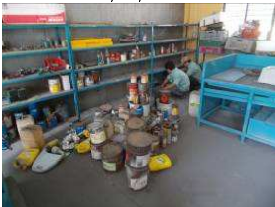
P8: In painting, were certainly more than 100 cans without color! Why not disposed of?