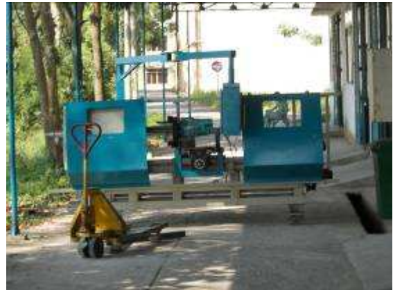
P32: The has long been left standing machine WIAP DM25 we have now moved from the space 3a in the chamber 5, that we can have much more fine.