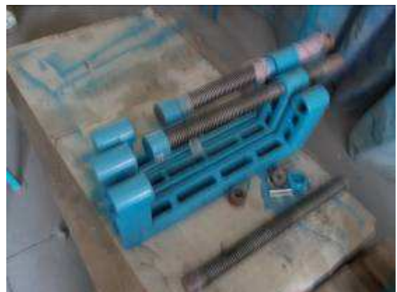
P11: These large clamps have the visual inspection also failed. Spindle rusty not oiled! Deburring insufficient.