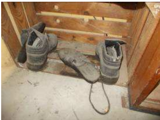
P37: Were still shoes behind my desk. Unfortunately, probably long no longer cleaned.