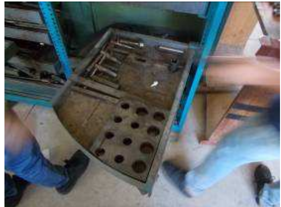
P9: In room 2 the mechanical workshop, all the drawers were inside very dirty and messy.