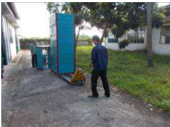
P31: In our school system, we have 2 weeks mainly just everything we reorganized something that apprentices have more joy.