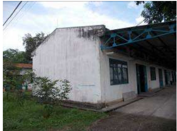
P15: This wall we have 2 x repainted since 2011. Again after 2 years it looks as if they had never been painted 20 years. The thing we need to track.