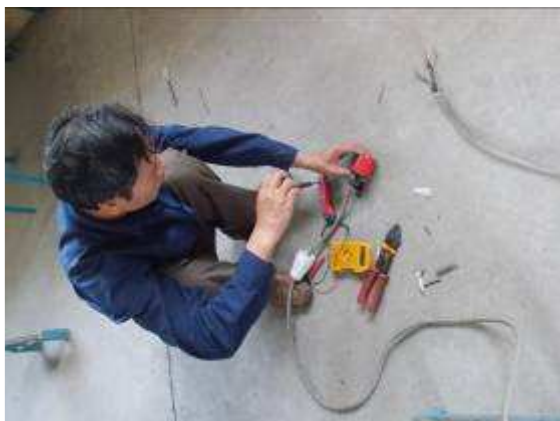
P19: Our electrician teacher joins them.