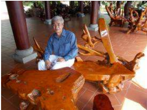
P29: Funny seats in the reception desk of the Hotel Chez Carole which is operated outdoors with only a roof.