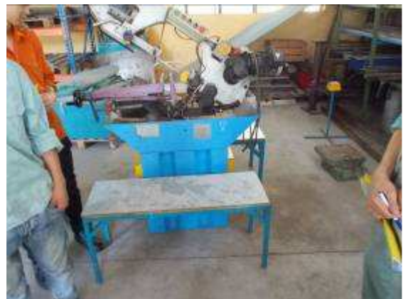
P45: In the room 4a we have the cutting room. On all machines we made the yellow boxes. That this saw is 2 yellow boxes has, shows that where the second mount was too lazy to walk to the machine and did not see that even a yellow box is mounted. The documents in the yellow boxes are not filled well that we now tested with inspections.