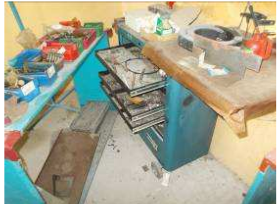
P39: Dare stand in the assembly room looked terrible. Because have a lot Gekos her "Schitt" dumped it looked really pathetic. We wondered what was our apprentices and instructors in recent months made.