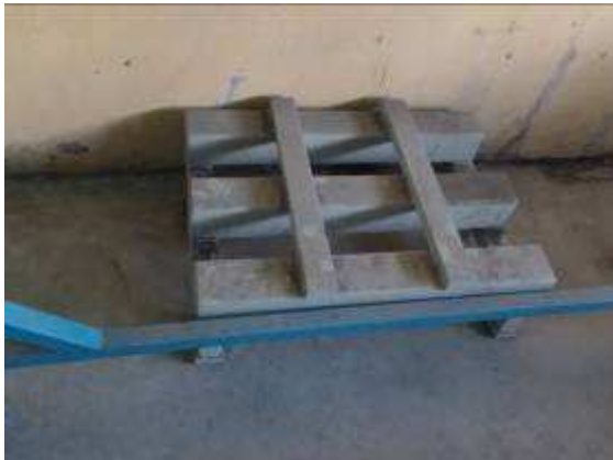
P6: The frame for the WIAP Dm2 S CNC lathe is dirty in a corner!