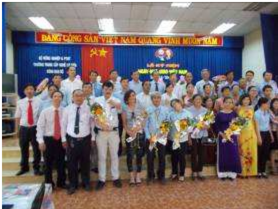
P53: There was now even a group picture of the whole school by all teachers.