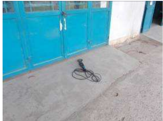
P20: Separating the target 1b of the castle. For some reason, the key has disappeared.