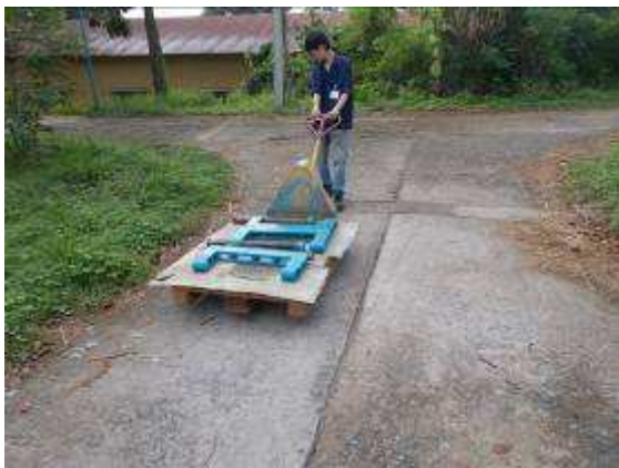
P13: Now go the big clamps in the welding room 1 to rework. Re-welding and visually make improvements where the instructor is responsible A04.