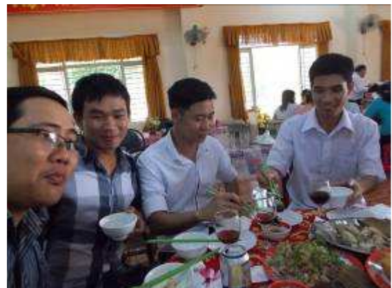
P56: After the ceremony, still came to enjoy the meal together with all our instructors and the school management.