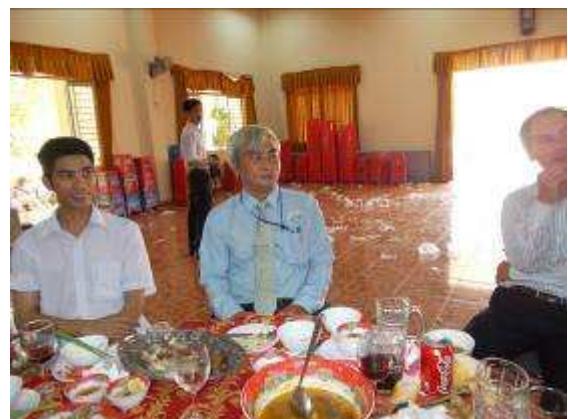
P57: On shot the celebration it was very interesting under our table was not an object among all the other tables were large quantities of waste everything under the table. Rear can see there after the tables were already cleared.