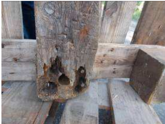
P41: Pallets were much greedy down from vermin.