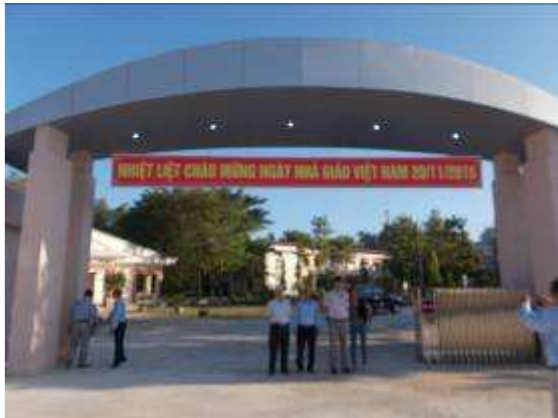
P30: On Monday morning was still opened the door of the school. We were the first since the allowed through.