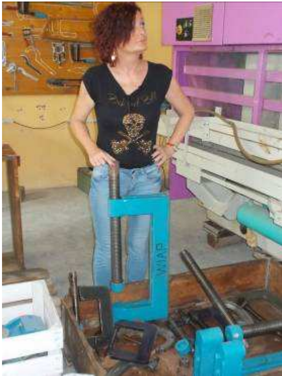
P12: The big heavy clamps clamp 400 mm.