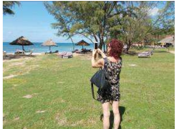
P26: A small tour on Saturday has given us more impressions of the island.