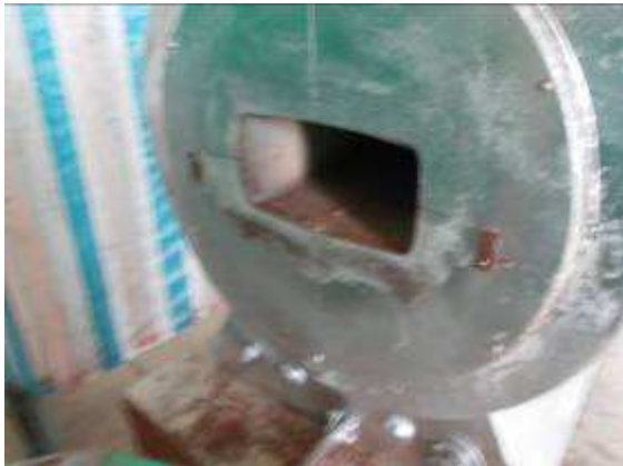
P23: The little hardening oven in the repair, the door was broken.