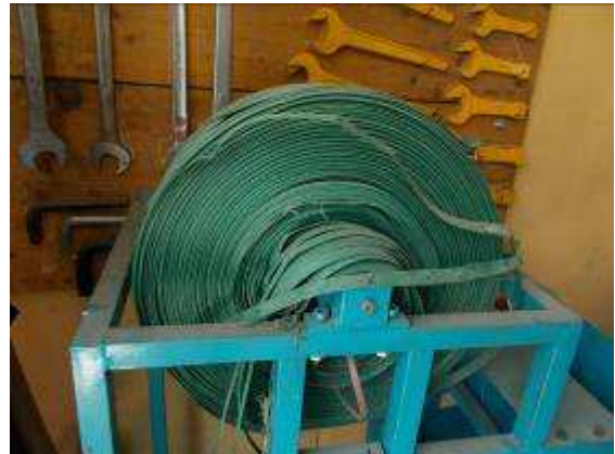
P14: These were bands that we bought to bind. When the air in Vietnam they are disintegrated by the air not good.