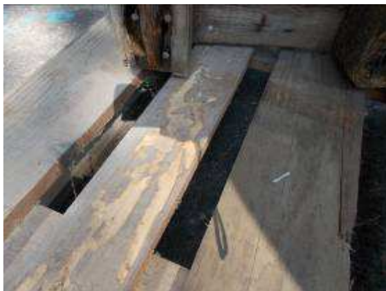
P42: As you can see this "Term Itten tracks". Bad.