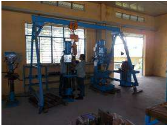
P35: We are glad that we made the mobile crane 2 tons.