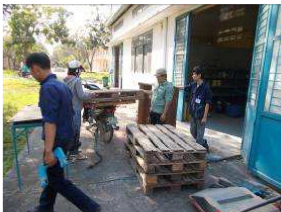
P43: We have to dispose asked the pallets into the open air. These were picked up in minutes and warn disappeared. We wanted to burn but came not to do so. Min. 20 pallets and 15 yards, we have thrown away.