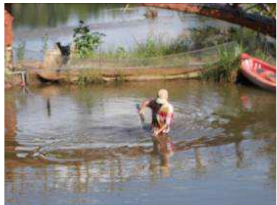
P27: front of our hotel window a man who works in the water.