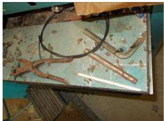
P40: Almost no tools in it, Geko "filth" and what else there was rusted.