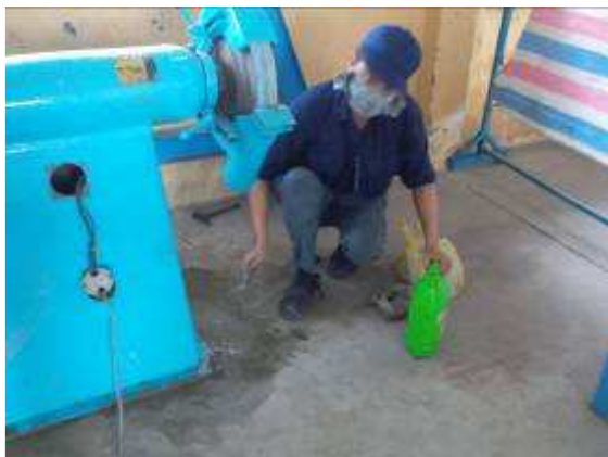
P18: The machine is attached to the bottom.