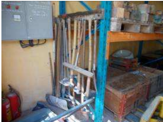
P36: In the room 3a we also have our tool finally nice. It was everything hung in a grid box.