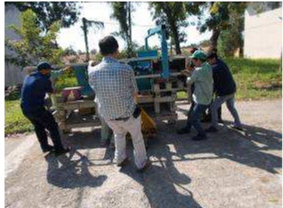
P33: With a palett carriage on the very poor cement floor because so much holes, the transport was quite difficult. But we managed.