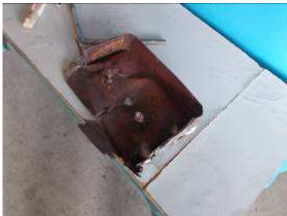
P24: and rusted. The heat has also been stone repositioned.