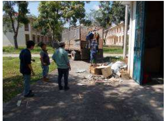
P44: For the remaining goods was also a truck and took it off. In Vietnam that is free of charge.