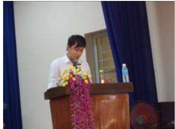
P55: Our apprentices from the D group is the selected group spokesman of our WIAP project.