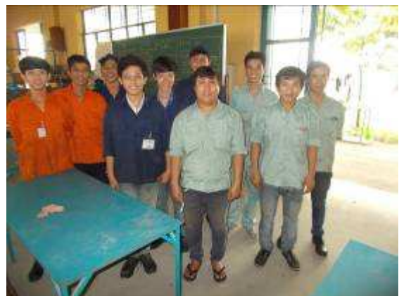
P16: Our apprentices with the instructors. Too bad that the chef instructor as a model on all pictures wearing open sandals stands there, these are our role models!