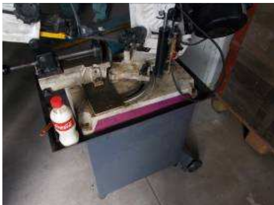
P7: The small band saw that we brought to the last container No. 9. Very dirty.