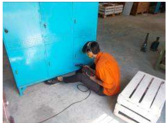
P21: The new wardrobes closet where all apprentices can put shoes. Teaching guidelines put away and can move in teaching. The cabinet made the apprentices.