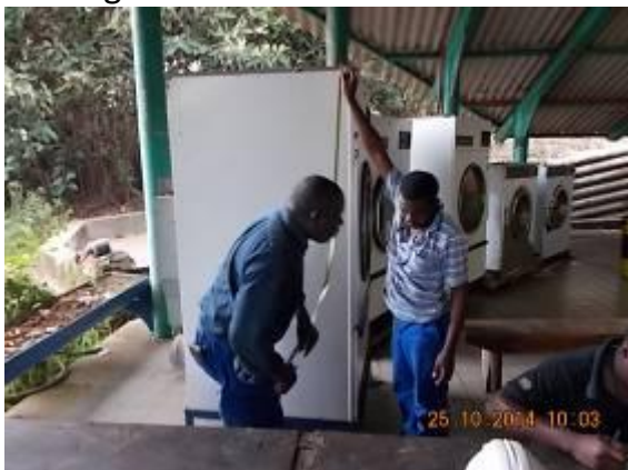
Figure 2: is interesting how the professionals interested.