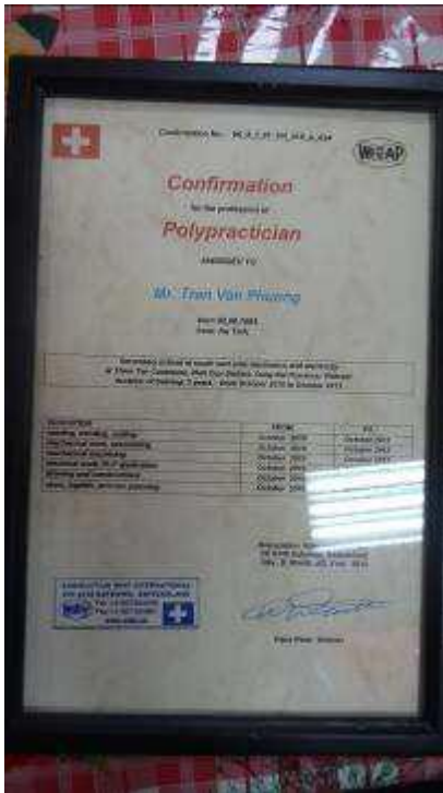
Figure 4: Certificat for the first group. This was approved in Hanoi issued so