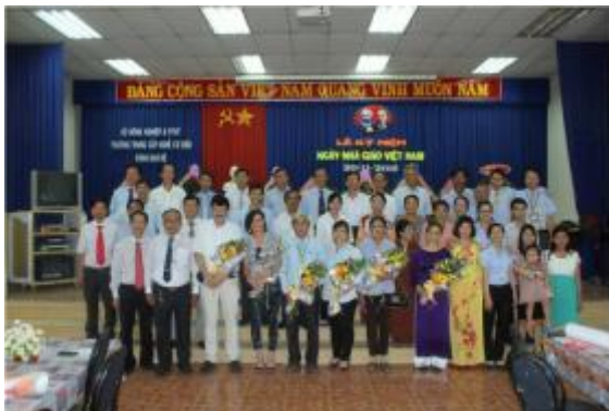
Figure 5. completion ceremony of the A group Start 2010 End 2013 in the school grounds of school of Agraministeriums in Vietnam near Saigon.