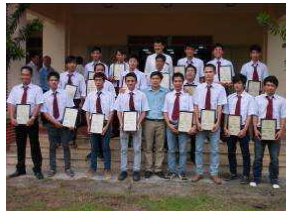
Figure 3: 1. Group apprentices in Vietnam 20 The Polypraktiker learned after the dual education system WIAP