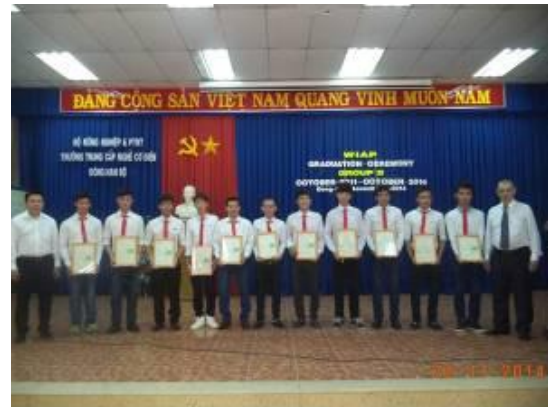
Figure 7: Farewell ceremony of the B group start 2011 End of 2014