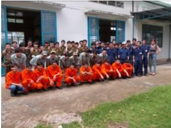
Figure 4: A group of blue, brown B group, C group green, D group Orange 12 new apprentices of the D group.

The profession Polypraktiker, 66.5% mechanics, 33.5% Electrical. On 12.06.2013 it has approved the project, the vocational training ministry in Hanoi. On 29.06.2013 it has approved the project at school, the Ministry of Agriculture in Hanoi, where we = our training workshop with six rooms a 150 m / 2 have almost 1000 m / 2. Equipment and inventory were buried up by us from Switzerland. The majority of Swiss and European machine tools.