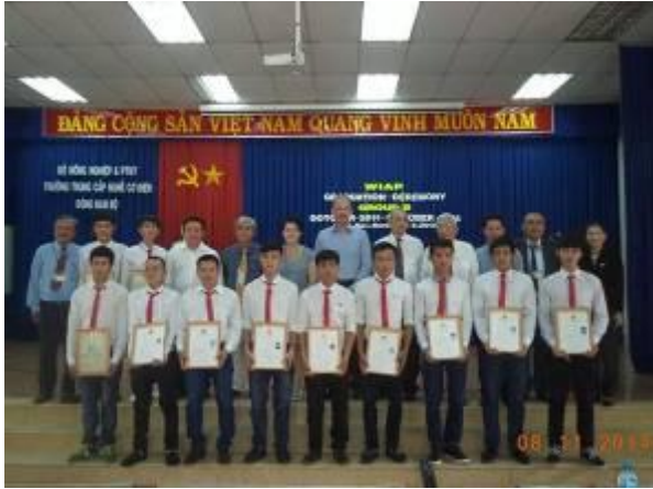
Photo 9: Group picture with Consul General and his wife. At the ceremony